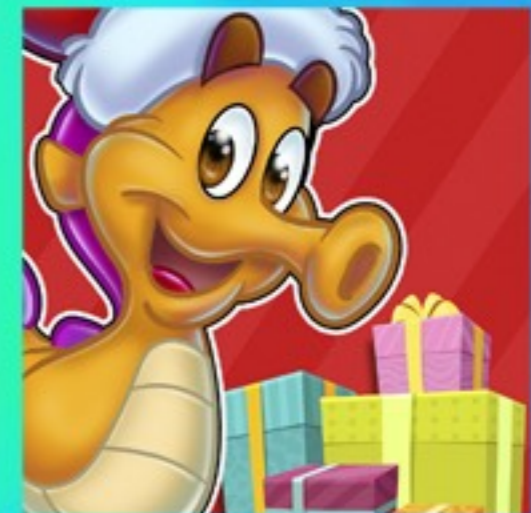
FRIENDFISH ADVENT CALENDAR