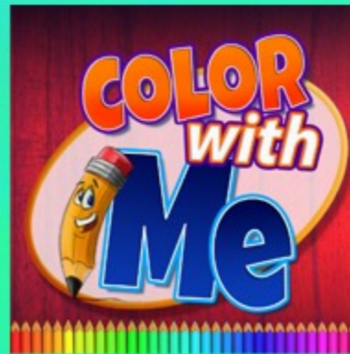
COLOR WITH Me!